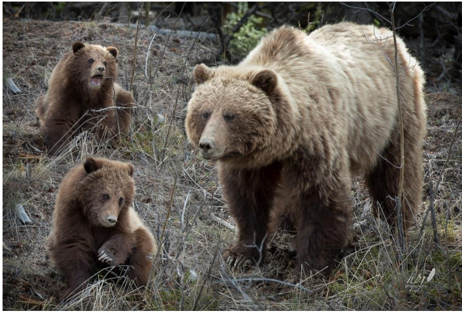
Mama grizzly and who two babies near Carcross