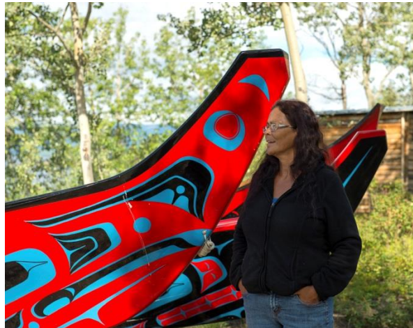
C/TFN's Traditional Tlingit Canoe (T'a- King Salmon)