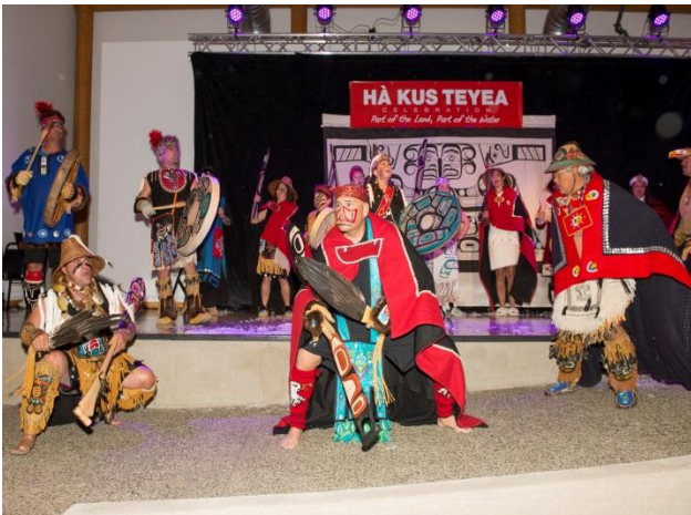
Dhakka Kwan Dancers