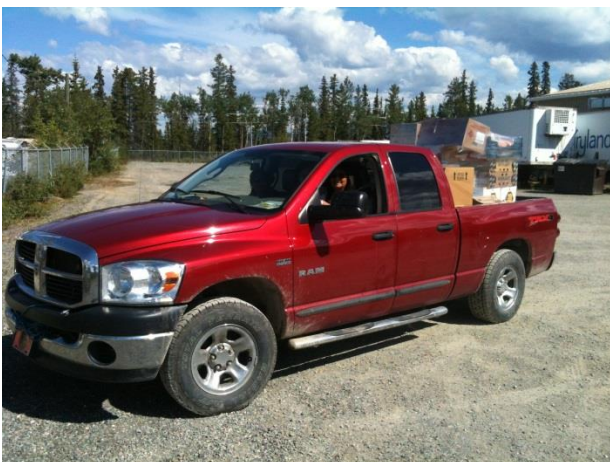
Donna's truck all loaded up with dinner groceries