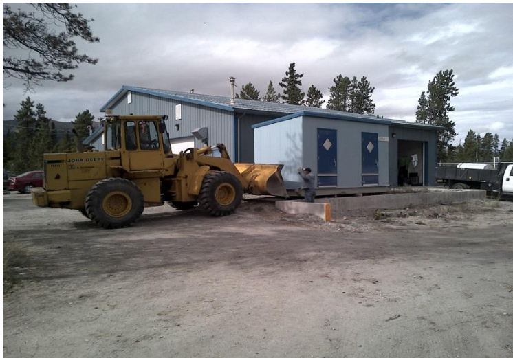
Mike Smarch unloading chemical storage building

The snow is almost here so good luck in your winter preparations!