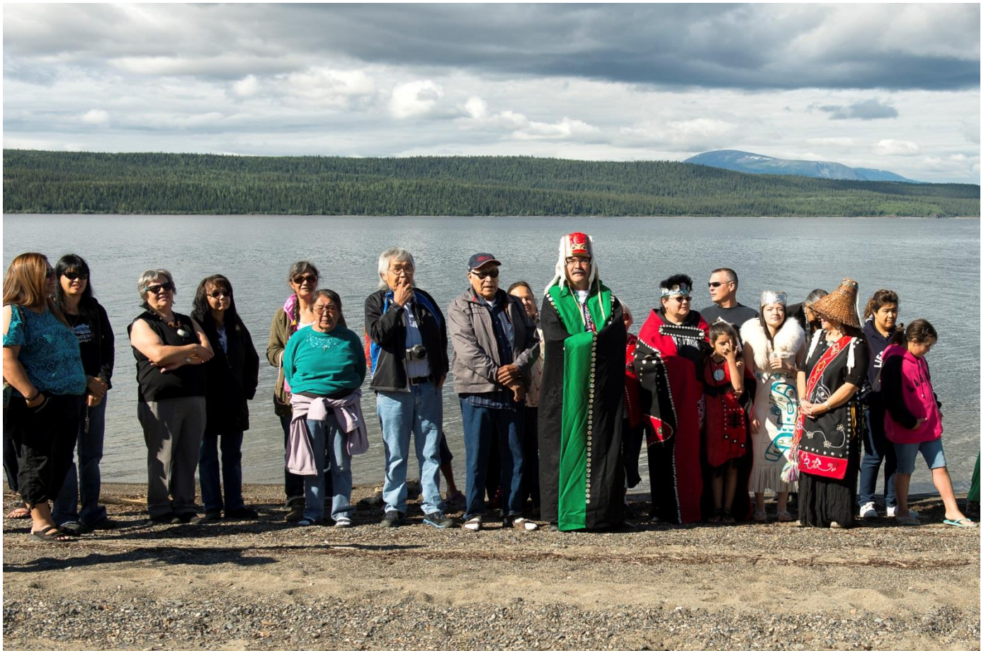
Arrival of C/TFN Citizens at Ha Kus Teyea Inland Tlingit Celebration (July 2013)