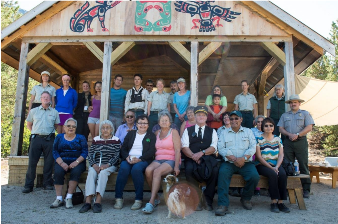
Pictures from the Elder`s Train Ride (August 1, 2013) and the Canoe Launch